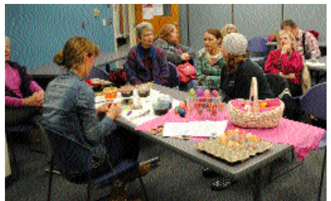
OKC group enjoys March program