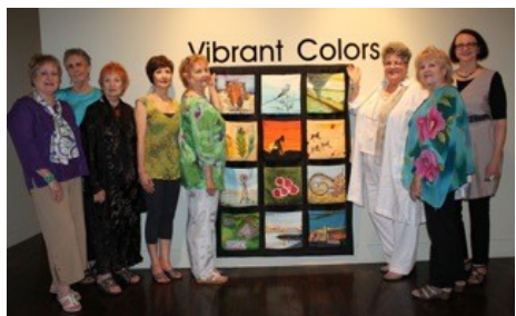
Left: Silk Painters Guild of Oklahoma's members and their finished quilt that will be shown at the Silk Painters International "Threads of Silk" Festival.