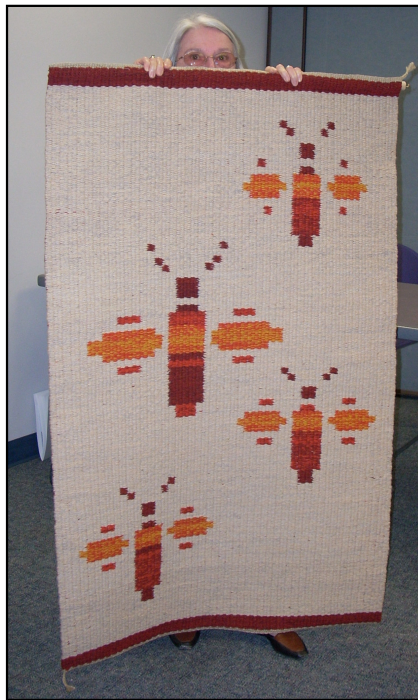
Pond Series: Dragonflies by Janie Wester, was accepted in Fiberworks 2009