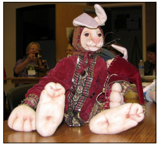
Doll by Rae Sook