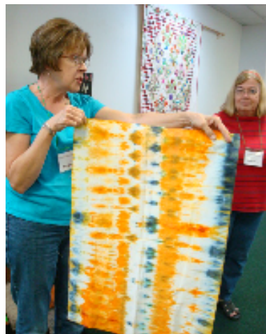
Pat Brant's ice dyed fabric