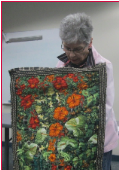
Dawn Pyle's floral piece