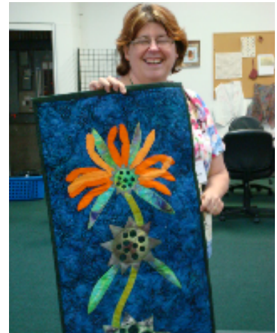
Debi Pickens' Quilt