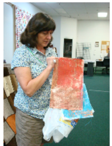
Rhonda Steiner's gel plate prints